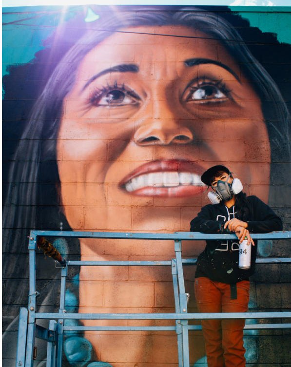
Herrera utilized spray paint to create the mural.