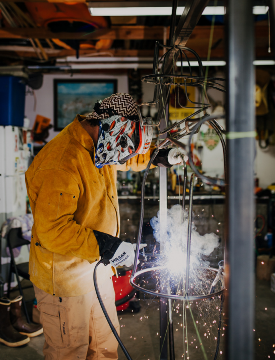
The artist at work in his home studio.

The Vitruvian Firefighter is an idealized firefighter made of welded steel rod, referencing Leonardo DaVinci's The Vitruvian Man .