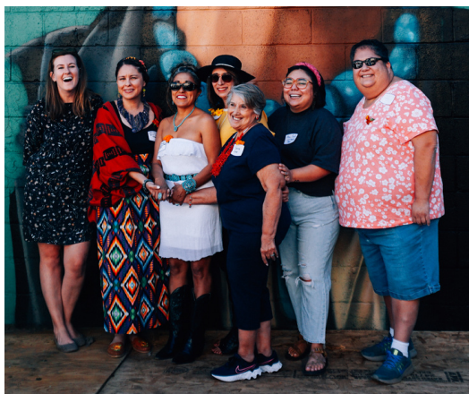
Members of the mural committee pose with the artwork.