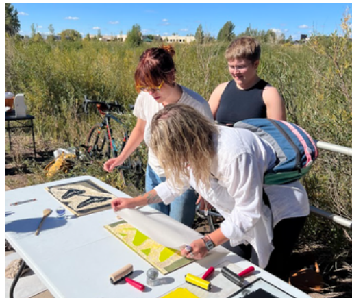
Making prints on the Greenbelt with the public.