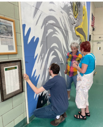
A former students resigns the mural.

Albany County School District's Slade Elementary School moved to a new building in fall 2022. LPAC helped celebrate the Slade mural in the original building painted by students with the design direction of artist Harvey Jackson in the early 2000s.